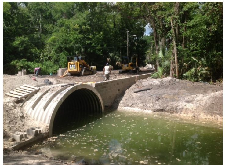
Photo No. 2 – The canal crossing is complete and the retaining wall is under construction.

Residents with questions, comments or concerns are encouraged to contact the City or their Resident Project Representative, Ed Gard, at (407) 539-4515.