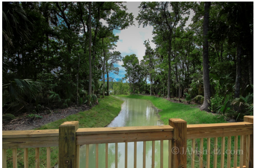
Photo No. 2 – Newly dug canal and boardwalk between Central Park Lake North and the adjacent lake to the east

Residents with questions, comments or concerns are encouraged to contact the City or their Resident Project Representative, Ed Gard, at (407) 539-4515.