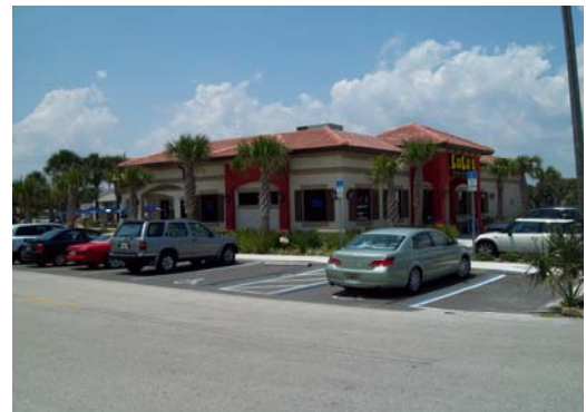
30 S. Atlantic Ave – AFTER