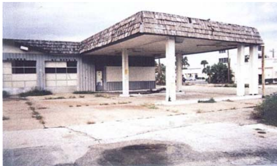
30 S. Atlantic Ave – BEFORE