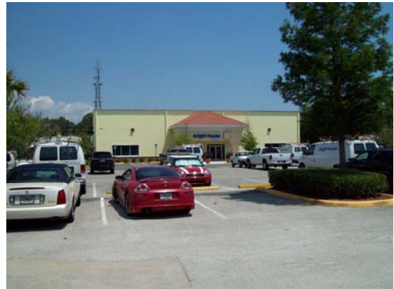
333 W. Granada Blvd – AFTER

For more information, please contact: The Ormond Beach Planning Department at 676-3238 or Ormond MainStreet at 451-2138.