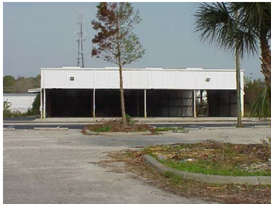
333 W. Granada Blvd. – BEFORE